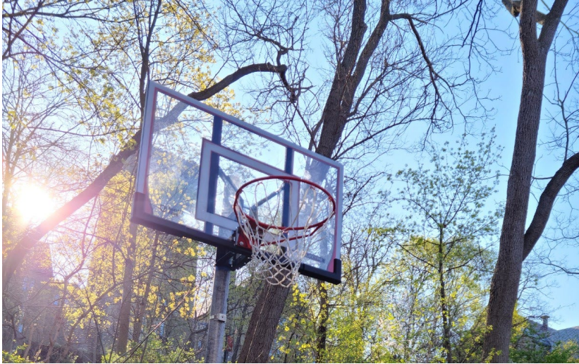
New Basketball Hoop